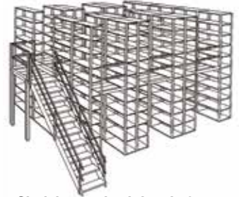
Shelving on both levels for high density storage.

Stairs: All applications involving stairs are reviewed individually and designed to meet or exceed local, state and federal codes in effect at the location where the stairs are to be installed.