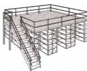
Deck-over unit provides an unrestricted work area.