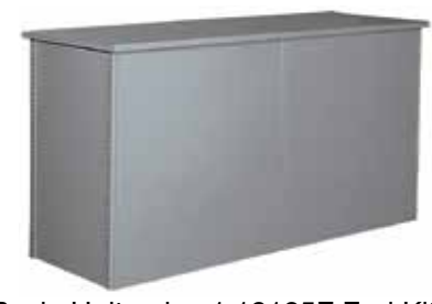
Front and rear views of 2 1H122C Basic Units plus 1 19125E End Kit