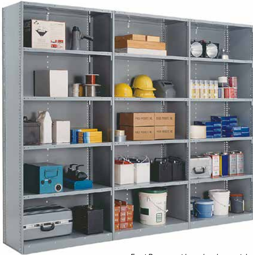
Front Bases must be ordered separately.